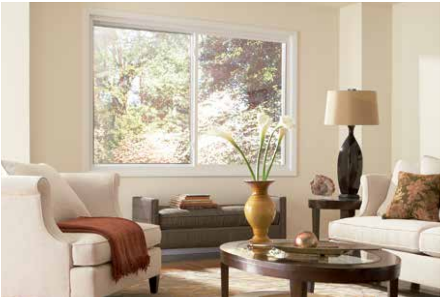
Above Top: Fusion Double-Hung Windows feature a constant force balance system to ensure smooth operation; both sashes tilt in for convenient cleaning from inside your home. Above: Fusion Sliding Windows glide horizontally on a nylon-encased dual brass roller system, and the sashes lift out for easy cleaning.