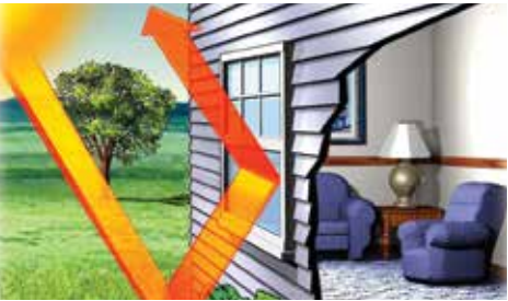
Summer Energy Savings: Low-E helps block unwanted solar heat penetration to help reduce air-conditioning usage.

Reducing energy loss is often the number one reason for purchasing replacement windows. When you consider that windows are roughly 80% glass, you'll see why upgrading your windows with an insulated glass system can significantly improve the overall energy efficiency. Our optional ClimaTech glass package combines insulating Low-E (low-emissivity) glass, argon gas and the Intercept Warm-Edge Spacer System that features a unique, one-piece metal alloy, U-channel design that creates an effective thermal barrier. ClimaTech insulated glass packages have proven to be far more effective than ordinary insulated glass units. Low-E glass also helps minimize UV rays that can cause furnishings to fade.