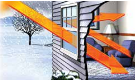
Winter Energy Savings: Low-E insulating glass reduces heat loss by reflecting warm air back into your home.